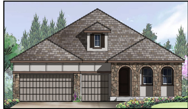
A rendering of the model currently being constructed

All four units, including the model are currently under construction and Taylor Morrison expects to have the model home ready in October. A sales trailer is on site and there are Taylor Morrison representatives present with project literature available.