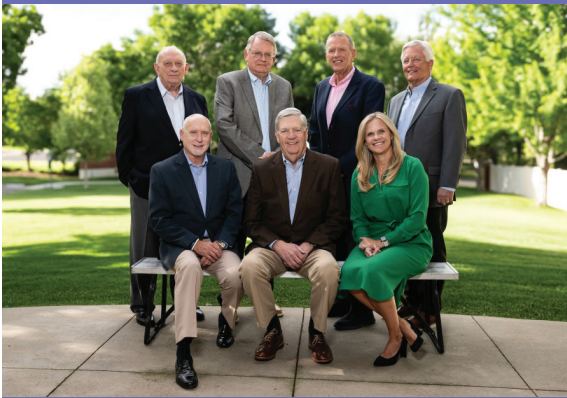
Bruce Menk, Mayor (Term Expires April 2026)